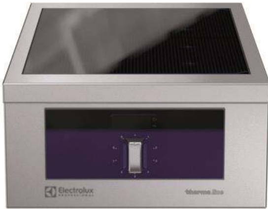
589017 (MCCBACEOAO) Infrared Top, 2 zones, two-side operated